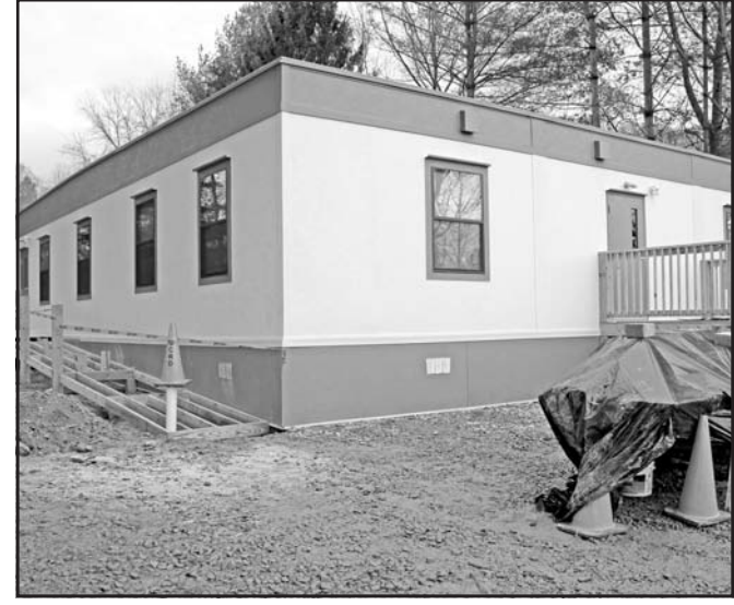
The new headquarters for the North Enotah Drug Court are located across from the Union County Public Library, in a building built just for the program. Construction is still underway, though the building is fully usable and began housing classes two weeks ago.

are located in a specially designed, 2,600-square-foot modular unit across from the Union County Public Library, where they were installed the week of Christmas.