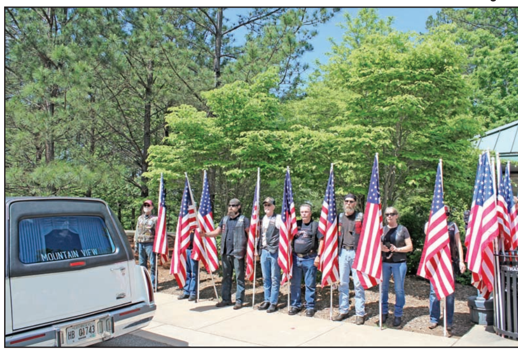
Veterans greet the five who were laid to rest at the Georgia National Cemetery in Canton on Wednesday, April 26.