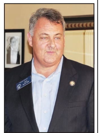
District 51 State Sen. Steve Gooch See Georgia Politics, Page 3A