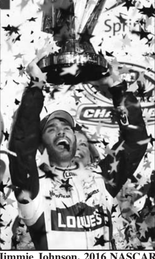
Jimmie Johnson, 2016 NASCAR Sprint Cup Champion World Truck Series champion

Drivers typically get paid entage of purse and point-