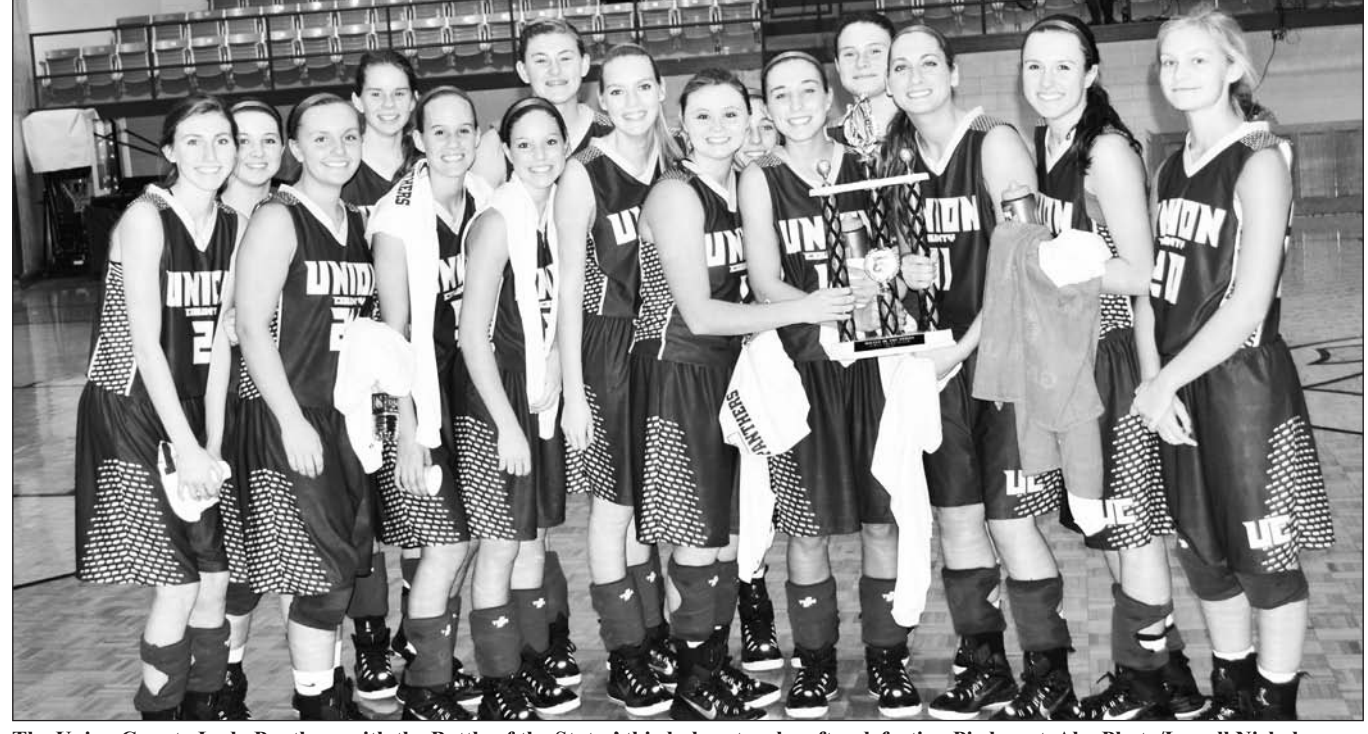
The Union County Lady Panthers with the Battle of the States' third place trophy after defeating Piedmont, Ala.