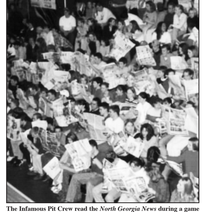
The Infamous Pit Crew read the North Georgia News during a game against Dawson County in the mid-1990s. The intent was to ignore the Panthers' opponent.

in the gym. The place was packed and the energy was awesome."