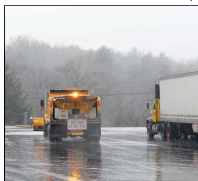
Local and county salt trucks were out in full force as the county and region fell victim to black ice on Friday.