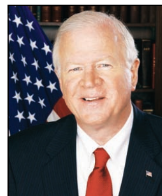
U.S. Sen. Saxby Chambliss

"After much contemplation and reflection, I have decided not to run for re-election to the Senate in 2014," said Sen. Chambliss, a Moultrie Republican. "This is a decision