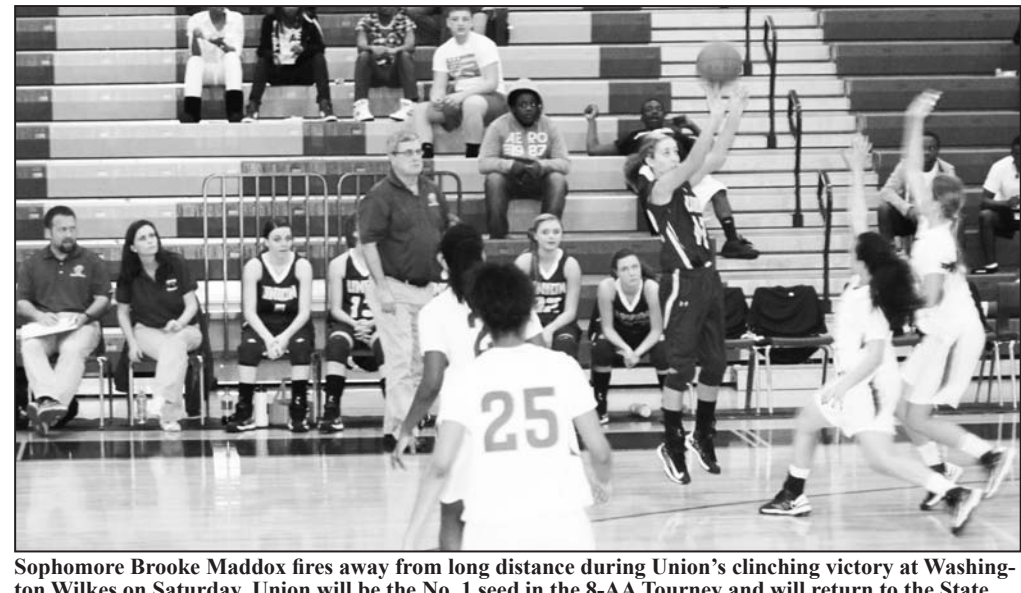
ton Wilkes on Saturday. Union will be the No. 1 seed in the 8-AA Tourney and will return to the State Tournament for the third consecutive year.