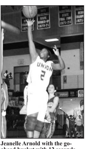
ahead bucket with 12 seconds

The first shot was on the During the scramble, money but the second went wide and Union secured the