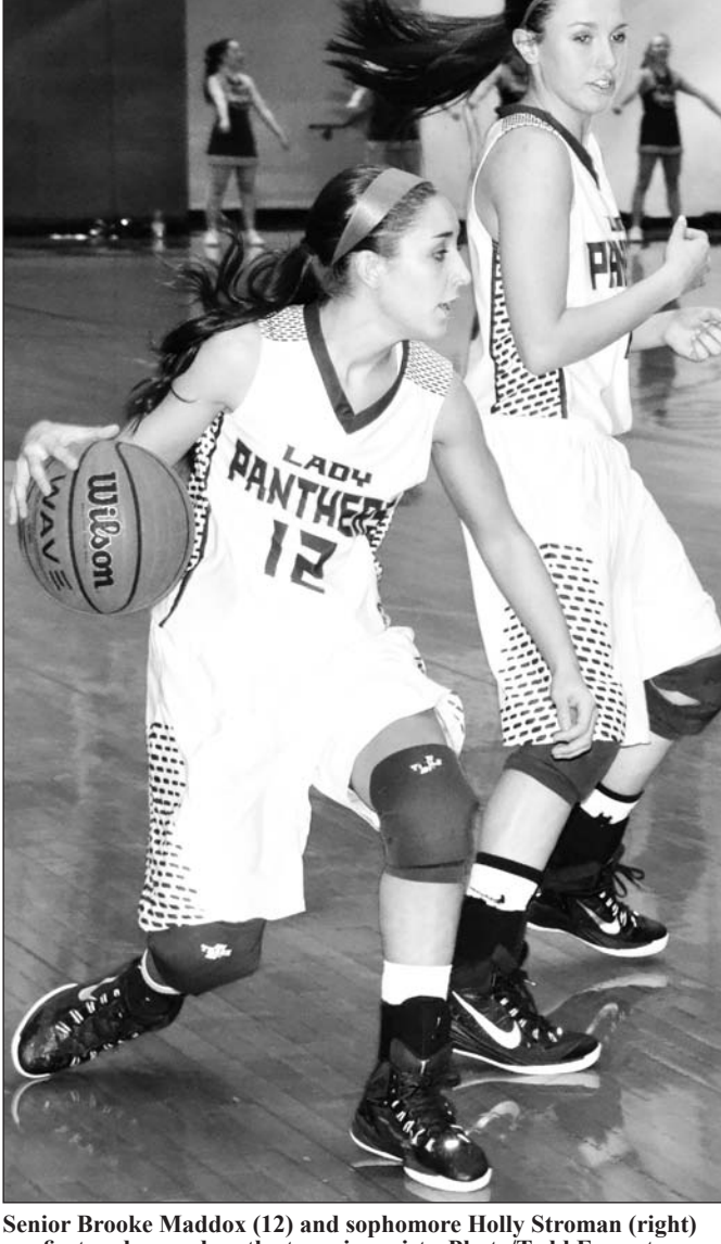
are first and second on the team in assists.

Inbounding from under the hoop, the Lady Cats quickly racked across halfcourt, where they called a timeout with 0.5 The third was all Rabun seconds left. But after some