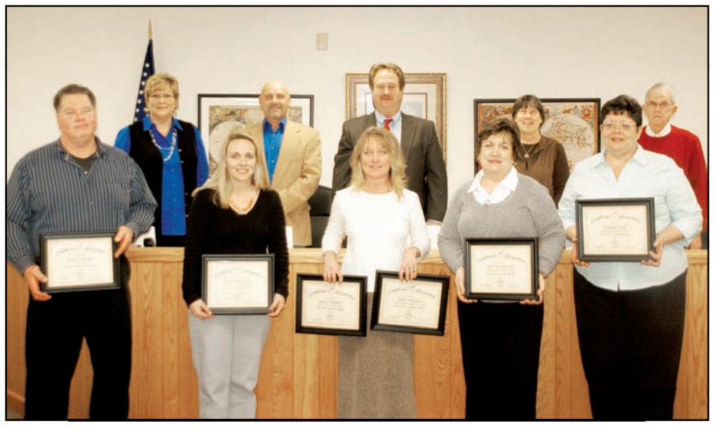
The 2013 Union County School System Teachers of the Year and the Board of Education.