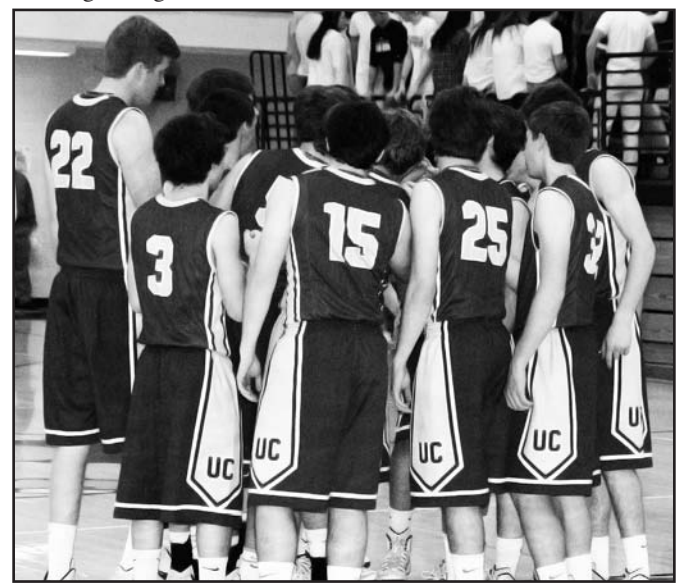
Panthers huddle before the opening tip.

SCORING: Hamby 17, Odom 16, Hughes 15, Shook 8,