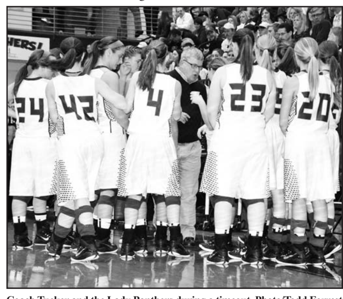
"They were hurt (after Coach Tucker and the Lady Panthers during a timeout.

As for the rest of Region 8-AA last week: Union was the only team to not lose by doubledigits. Top seeded Rabun fell on their homecourt, 61-51 to Dade County. Model smoked Greene County 70-29 and Armuchee took out Oglethorpe County 63-49.