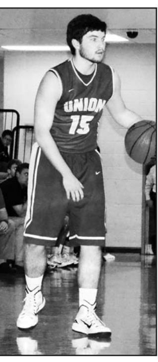
Senior Lake Arnick

As for the rest of Region 8-AA in the State Playoffs. No. 1 Greene County beat Armuchee 83-75 before getting eliminated by Thomasville in round two. No. 2 Rabun defeated Darlington 83-69 but lost to Seminole County in round two. No. 4 Washington Wilkes fell 72-52 at No. 1 Model.