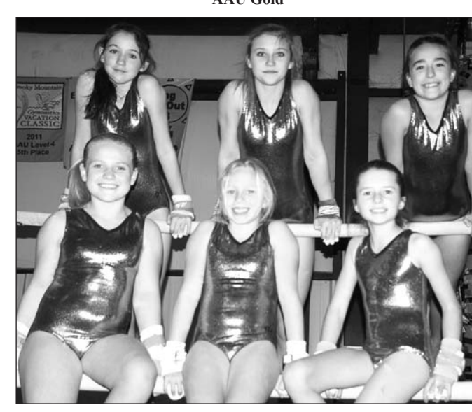
USA Xcel Gold