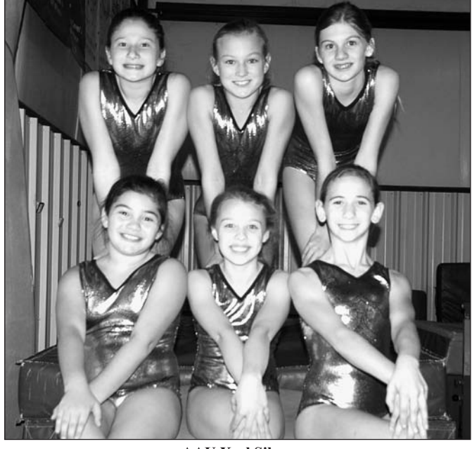
AAU Xcel Silver