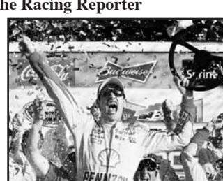
Joey Logano celebrates his first Daytona 500 victory.

of Saturday's Xfinity Series than that for Kurt. race at Daytona Internation-NASCAR suspended al Speedway, and took the laps, but pulled it behind the Kurt Busch after a judge said checkered flag in a nail-biting wall and parked it. He finished the former champion almost