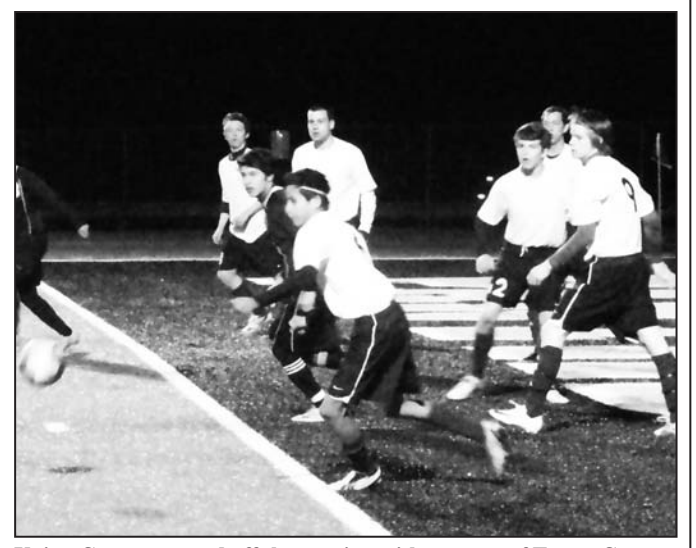
Union County capped off the evening with a sweep of Towns County after the Panthers prevailed 5-0 on Thursday.