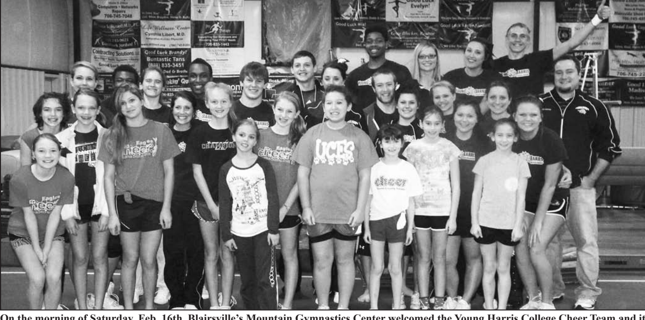
On the morning of Saturday, Feb. 16th, Blairsville's Mountain Gymnastics Center welcomed the Young Harris College Cheer Team and its coaching staff to host a three-hour cheer camp. A big thank you goes out to the YHC Cheer team and the Mountain Gymnastics Center for hosting this wonderful event.