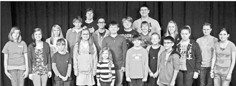
The cast The Neverending Story

One of the main purposes of Blue Ridge Community Theater is to introduce the magic of theater to all ages. Our Sunny D Children's Theater is a vital part of this mission as they take school age children (5 to 18) and teach them all aspects of theater production.