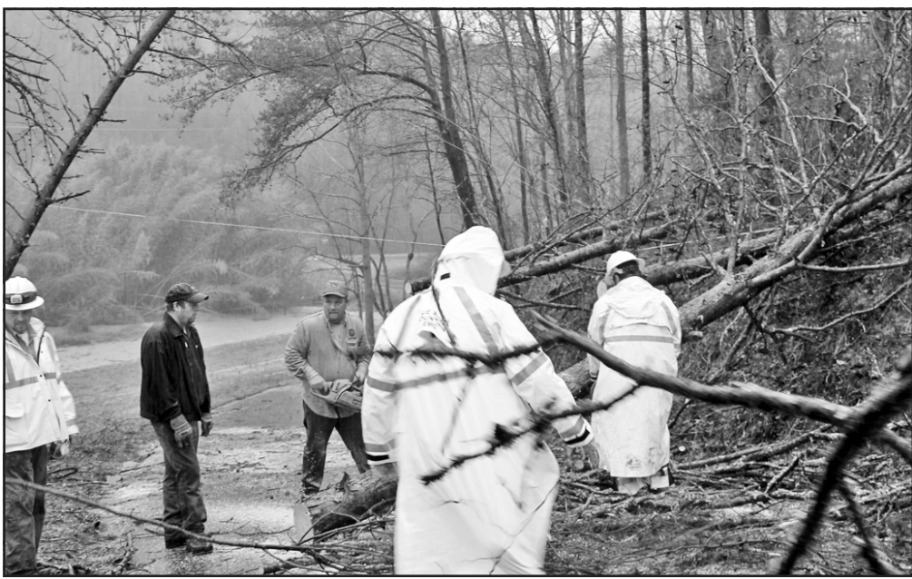
EMC crews work to clear downed trees to allow them to replace a twisted off power pole off Georgia 515 in Union County. Mother Nature kept the crews busy for 27 hours, Wednesday into Thursday.