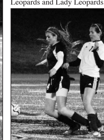
Lady Panthers defending during the first half.

6:30 p.m. encounter with the Leopards and Lady Leopards.