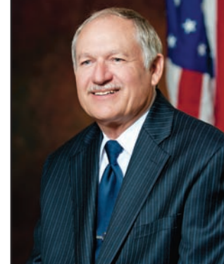
Sheriff Mack Mason series numbers on the last four digits."

"They used $1,500 in counterfeit $100 to purchase the gift cards," Sgt. Osborn said. "That happened late Sunday, March 8. The manager discovered what had happened on Monday morning. The $100 bills had the same