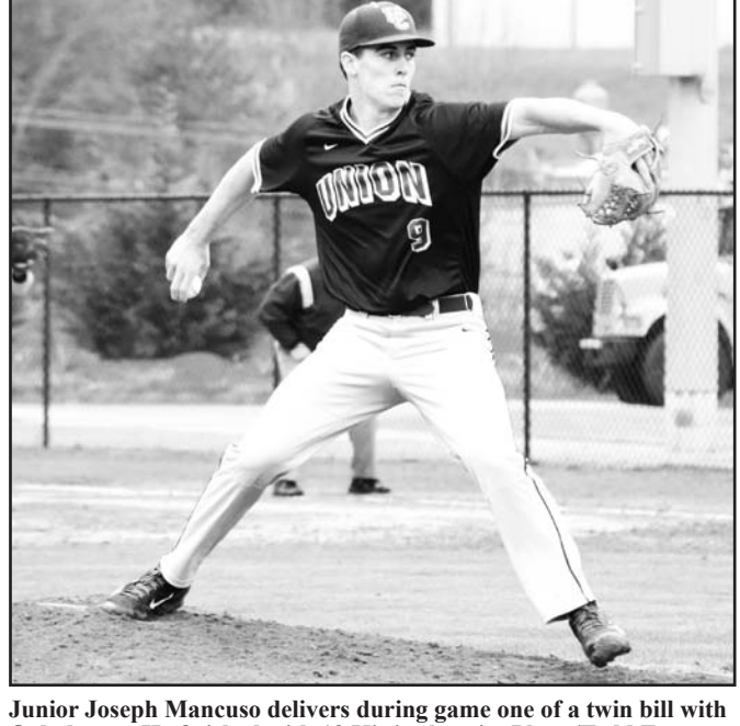
Oglethorpe. He finished with 13 K's in the win.

The Patriots and Rabun County had previously split a