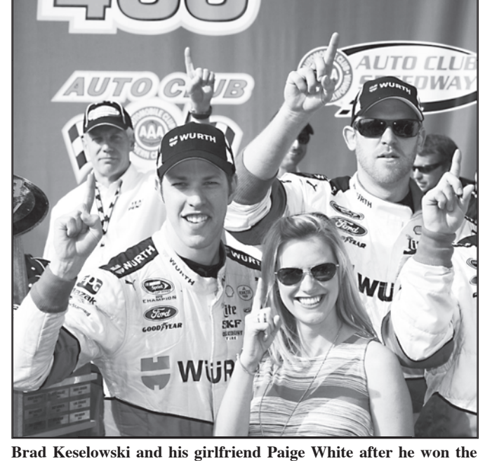
California Sprint Cup race. ray-120.

Top-16 Chase contenders after 5 of 26: 1. Harvick-225, 2. Logano-197, 3. Truex-192, 4. Earnhardt-164, 5. Keselowski-163, 6. Newman-162, 7. Johnson-159, 8. Kahne-159,9. Menard-152,10. Almirola-138, 11. Allmendinger-137, 12. Mears-132, 13. Kenseth-127, 14. Hamlin-126, 15 ragan-124 16 McMur-