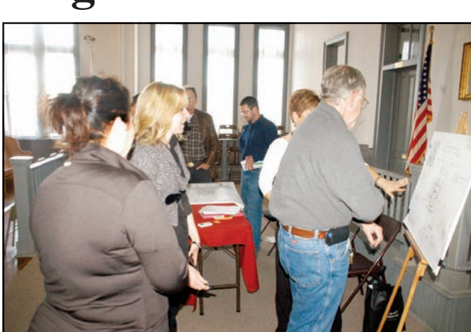
Locals gather around drawings of what Downtown will look like in the fall.

The construction of 8-foot brick sidewalks, and