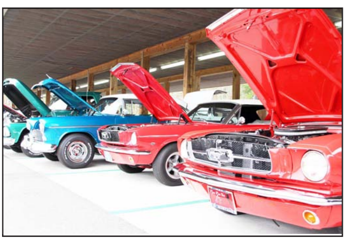
All proceeds from ticket sales and donations go toward local children's charities,

Of course, a Blairsville Cruisers Cruise-in wouldn't be complete without the annual car raffle, this year featuring a 2002 Silver Mustang GT Convertible, and tickets for the raffle are only a $5 donation for one, or a $20 donation for