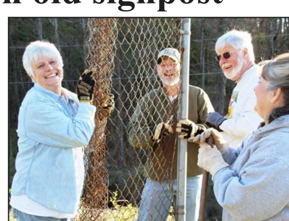
stood as a greeting just past the Blairsville Bypass coming into town from the Gainesville

Residents will remember the fence that has