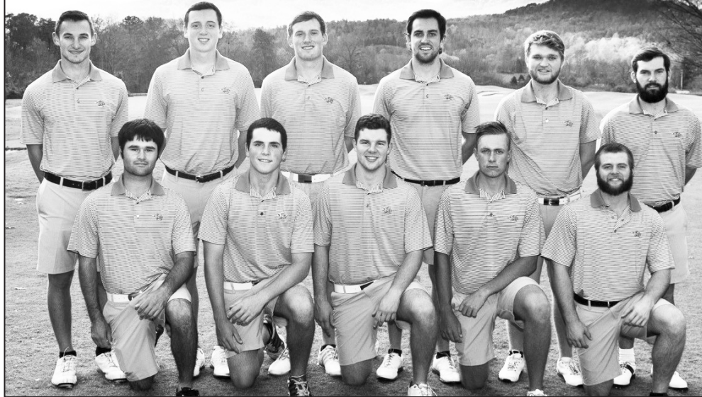
The No. 5 ranked Young Harris College Men's Golf Team is under the leadership of second year Head

ternationally," he said. "Luckily, I've made a lot of good contacts that make my job easier. But I think we have a good mix of local