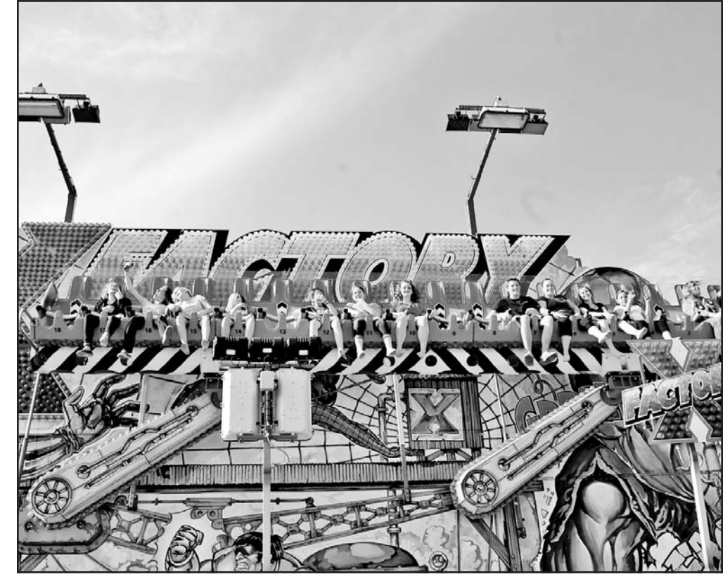
The X-Factory was a hit with young and old alike at the Blairsville Kiwanis Fair at the Industrial Park off Georgia 515.

The crowd remained strong and steady up until closing time at 10 p.m. when fair workers literally had to turn off the lights, the music,