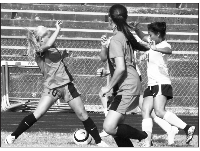
with a team from Region 5-AA it County (who will represent 8-AA was in the first round of the 2013 State Tournament and the Lady Panthers only held a 1-0 halftime advantage vs an overmatched Manchester. Union would go on to score six unanswered goals in the second half for the 7-0 victory.

Last week, Union played its final Region 8-AA contest Region 7-AA foe. when they traveled to Oglethorpe