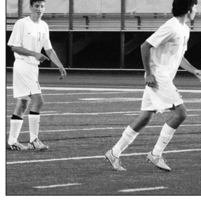
Thirteen of Thomas-Bryan County in the first round ville's wins are by shutout. Their two losses came to of the State Tournament. is a trip to Thomasville on Wednesday for a 5:30 meeting