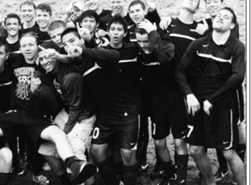
A wet and muddy Union County Panther soccer team celebrates after their opening round victory at Chattahoochee County on Friday evening.

to being on their level." Union County will visit Union County, along top-ranked GAC on Wednesday with the game time yet to be