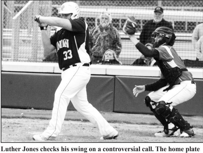
ump's ruling that Jones didn't go was overturned.

the first and went down 1-2-3 in the second.