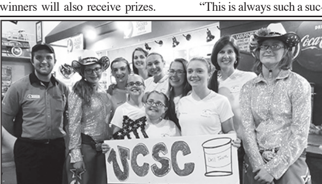
Members of the Sass 'n Saddles Precision Drill Team enjoyed serving chicken to the supporters at their recent Zaxby's fundraiser.

Union County Recreation Football & Cheerleading 7 through 13 years of age registration is going on