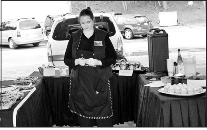
The Pampered Chef Lady at the 2013 Business Expo held at Union County Farmers Market.

turned out for the event at the Farmers Market.