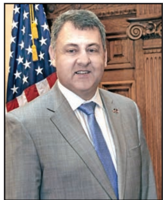
State Sen. Steve Gooch

After the results were counted, Gooch personally thanked the voters of Union County.