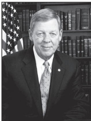
U.S. Sen. Johnny Isakson