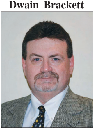
Candidate for Probate Judge See page 2A