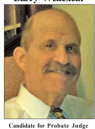
See page 2A