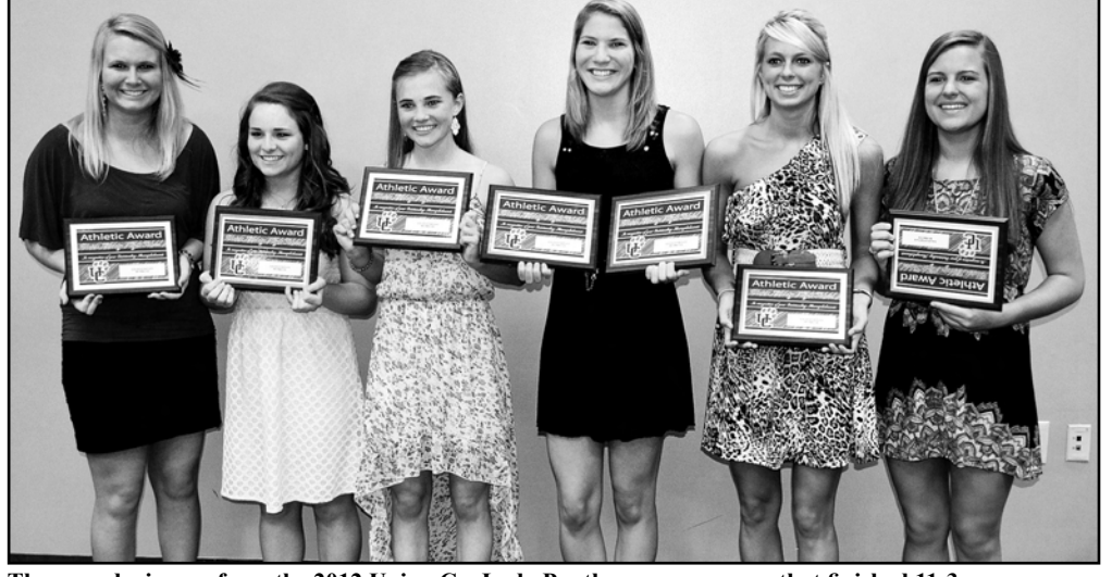
The award winners from the 2012 Union Co. Lady Panther soccer season that finished 11-3.

force. 'She played as a defender for the first time last season