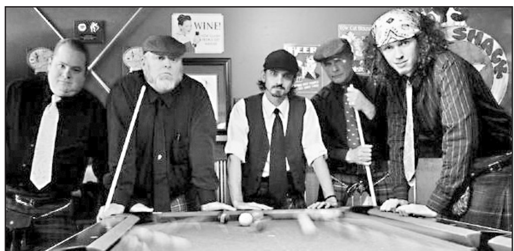
Uncle Hamish and the Hooligans will perform Saturday night at Meeks Park

Celtic Concert with Uncle Hamish & The Hooligans. The music begins at 7:30 p.m. and admission is only $5.