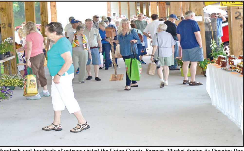
Hundreds and hundreds of patrons visited the Union County Farmers Market during its Opening Day

by the month. The Union County Cannery will be open for business on July 5, on Tuesdays