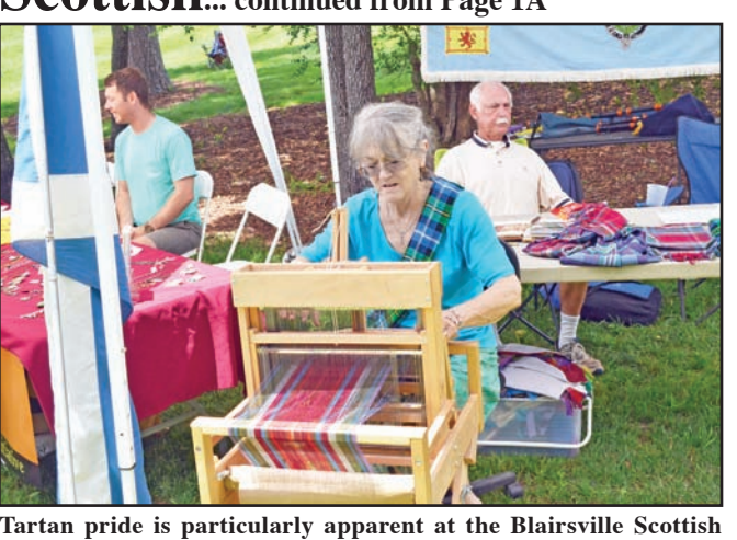
Festival, and the traditional weaving of garments is one of the many draws of the festival each year

family or tribe," according to blairsvillescottishfestival.com. "Each clan has its own tartan which is worn in a kilt or scarf, and members are fiercely loyal to the group."