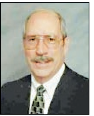
Candidate for Commissioner See page 2A