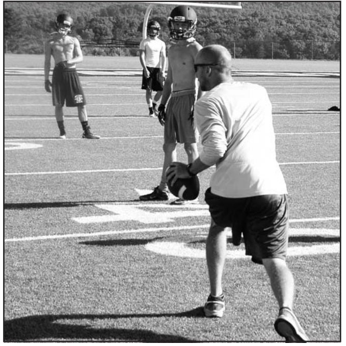
the upcoming season.

Last season, the Indians fell 28-7 after allowing three second half touchdowns to the visiting