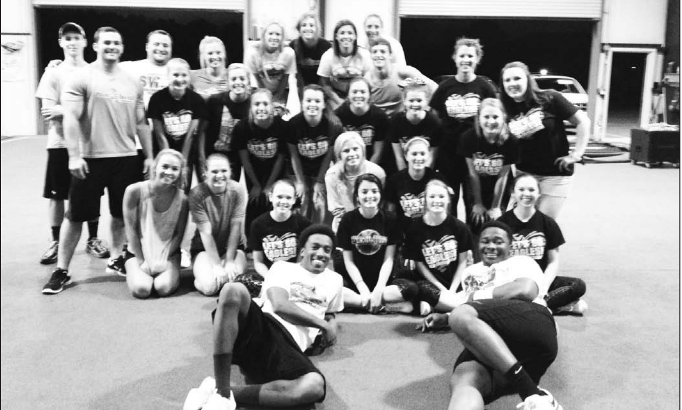
Mountain Cheer All-Stars competed in five competitions this year ranging in location from Nashville, TN to Asheville, NC to Atlanta. Through sickness, routine changes, and injuries, the girls worked extremely hard and made serious improvement throughout the season, with their highest finish of second place. They finished the season getting to work out with some of the cheerleaders from Young Harris College's nationally ranked competition team, as pictured above. Mountain Cheer All-Stars is still accepting new cheerleaders on Tuesday and Thursday nights from 7-9 p.m. Any girls that are upcoming 6th – 12th graders that are interested in competing can come by Mountain Gymnastics Center to get more information. No experience is needed, just a good attitude and a willingness to work hard.