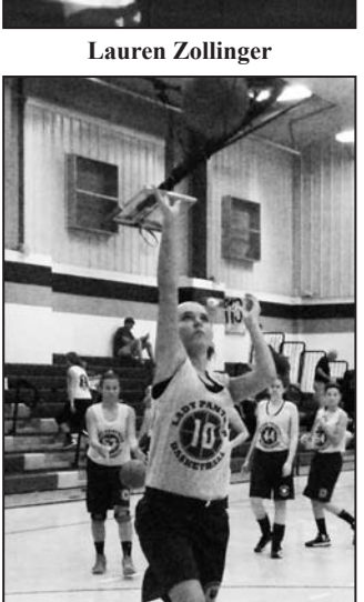
Lady Panthers warming up

lieve in the fast break. This belief has come from seeing the productivity of the break during the games. Our big men are running the floor and the guards are getting them the ball. We still force too many passes which results in turnovers, but we're running and that's the main thing I want to see. As time goes on we want to eliminate turnovers and be able to play fast, but not hurry. We have had great attendance all summer. "These guys have really