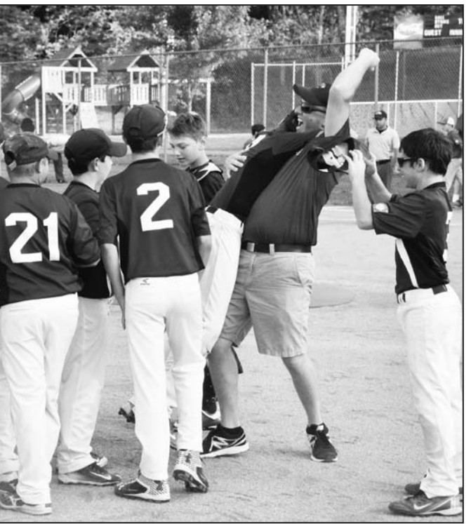
The 12&U all stars celebrate following their come-from-behind victory over Towns County in the championship.

After disposing of Hall, Union got its first shot at unbeaten Towns County and took care of business - resulting in a winner-take-all District Championship game on Wednesday.