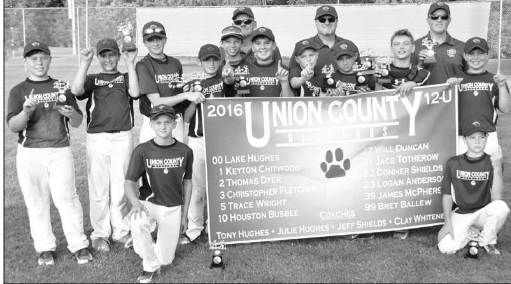
Union County's 12&U baseball team had to battle its way out of the losers bracket to defeat Towns County twice, with the clincher coming last Wednesday night in Blue Ridge.

eight games over six days but the Union County 12&U baseball all-stars eventually prevailed after falling into the losers bracket - forcing them to win five-straight to punch their ticket to the State Tournament.