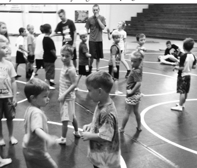
Wrestlers of all ages hit the mat during the recent wrestling camps

wrestling camp I didn't have the numbers that I wanted to have, but it was amazing with the ones that came. I've never done anything like this before and if I'd have known how receptive this would've been, this style of coaching, I would've done it 20 years ago. I had 5-year olds doing moves that the high school kids from the everyday repetition for 3-hours. Don't get me wrong, we still cover the basics first, but you drilled it so much that they became bored, so we just started throwing extra moves at them and they were able to soak it up like sponges.