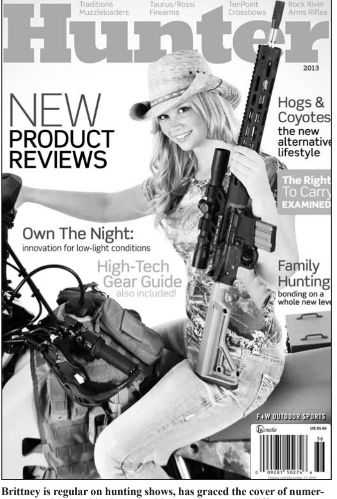
ous magazines, and is always making appearances at different events.

a friend of ours gave her the - Black cerakoted blade with Hunter version (Black cera- black grips, pink bolts and pink koted blade, black grips with claw (butt), and her signature orange bolts and claw) to use on engraved in pink, with "Hunta hog hunt a few months ago," ress." The "Huntress" comes Anglesey's Russ Owens said. with a black kydex sheath en-The women's version graved with her signature and