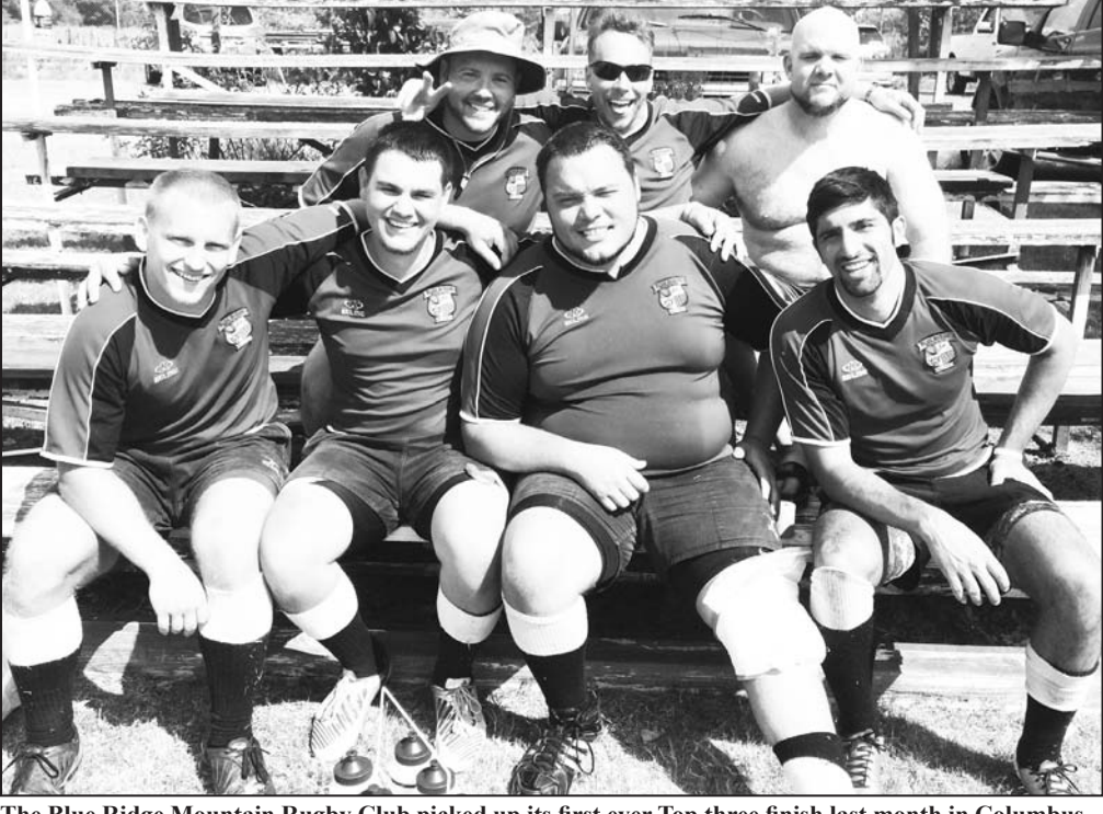
The Blue Ridge Mountain Rugby Club picked up its first ever Top three finish last month in Columbus. On Saturday, June 21st,

Blue Ridge Mountain Rugby Football Club traveled to Columbus GA to play in the longest running 7's tournament in GA (31 years). Due to varying circum-