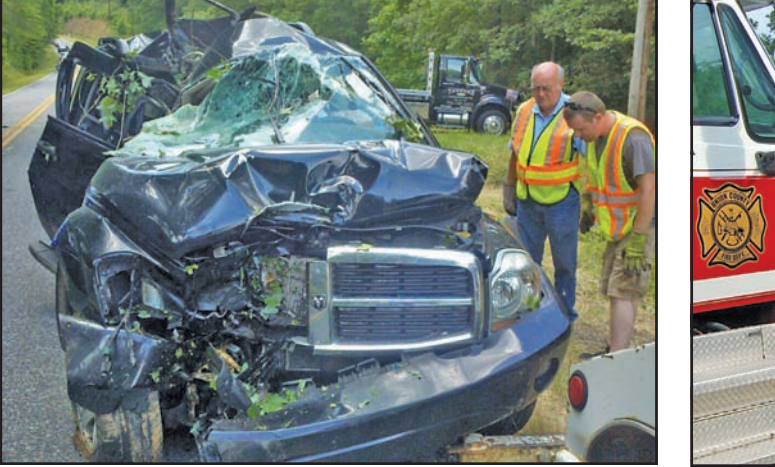
Left, a black Dodge SUV involved in a one-vehicle crash on Georgia 180; right, emergency workers rescue a woman trapped in a crash at Pat Colwell and U.S. 129.