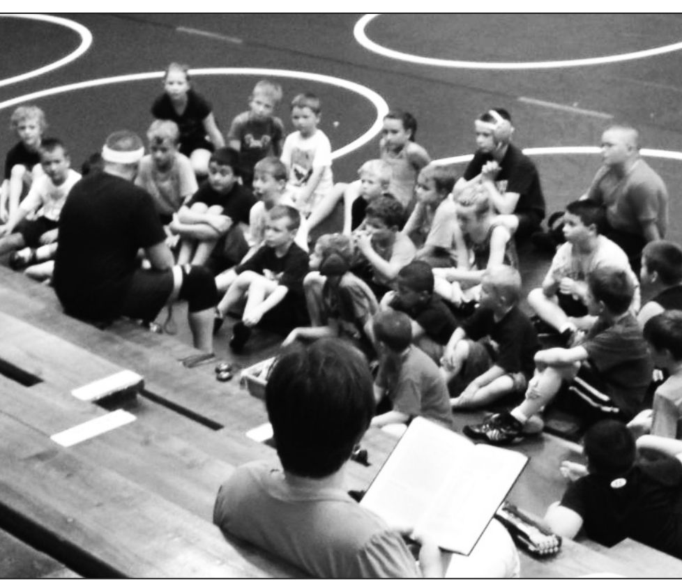
Youth Wrestling nights at the Pit offered something for everyone. Now Union County wrestling will take a break until the school year begins and the season opens in the fall.