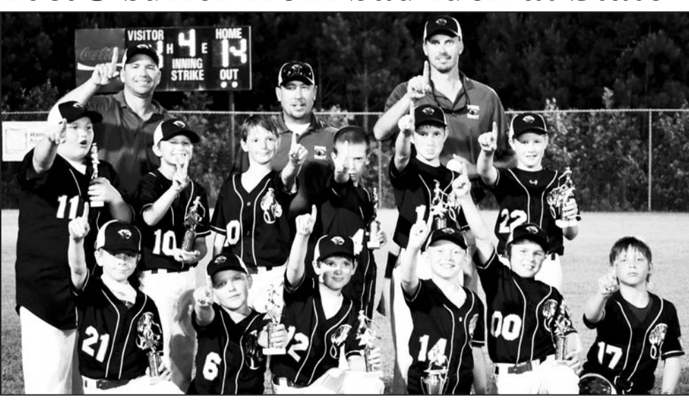
The Union County 10&U baseball team participated in last weekend's State Tournament where Mother Nature rained out the first two days of the tournament forcing the tournament directors to switch to a single-elimination format minutes before the first pitch. Union fell to host Whitfield County on Sunday eliminating the Panthers from the State Tournament