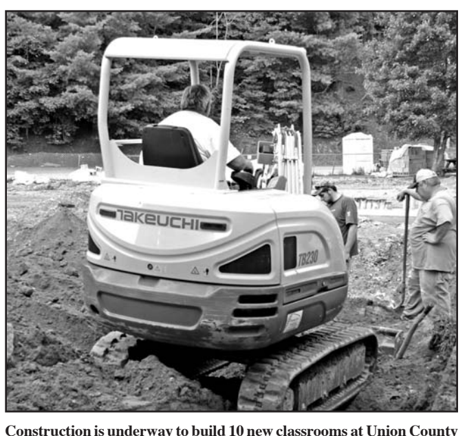
Construction is underway to build 10 new classrooms at Union County Primary School

"There's not really much we could have done about it regardless, but they're paying