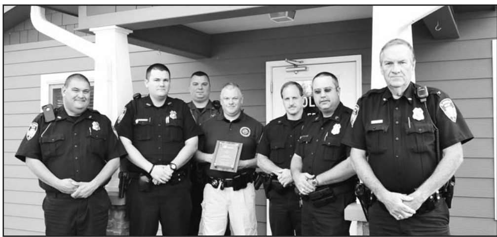
Blairsville Police Department repeats as MADD's Agency of the Year.

"Our job isn't just to arrest people; our job is to