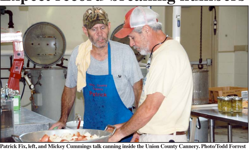
$190,000, installed) the open

By Todd Forrest North Georgia News Staff Writer