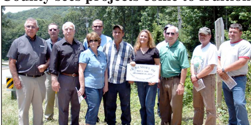
Union County government played a role in a new guard rail on Skeenah Gap Road in memory of 16-year-