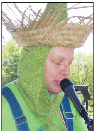
Mr. Green Bean