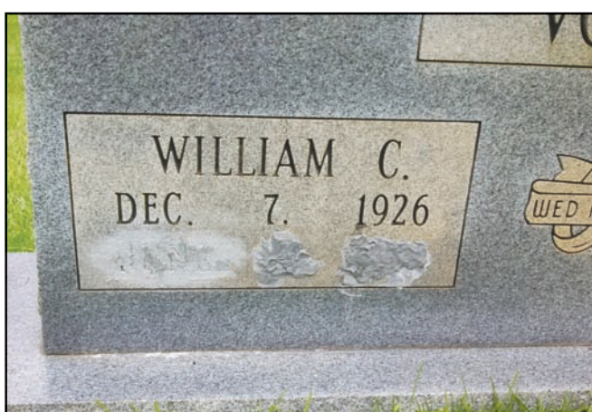
The damage to this headstone is beyond repair.

"The family has offered a $5,000 reward for the arrest and conviction of