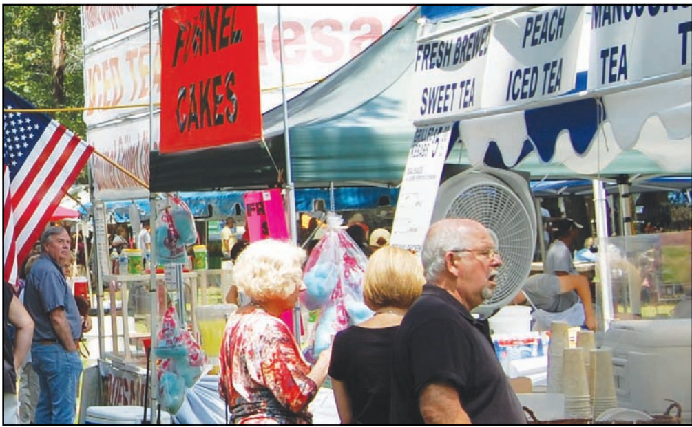
It was a great weekend for a festival at Meeks Park.

Acquiring a booth at this unique festival doesn't come easy. All applicants are screened, limiting participation to 70 artists, ensuring