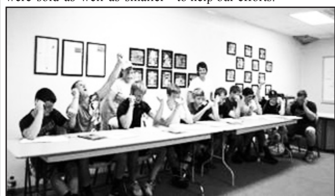
UC players fist pumping when receiving a commitment for an ad.

Please do what you can to help our efforts.