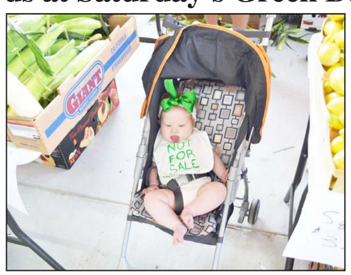
Not everything was for sale at Saturday's Fifth Annual Green Bean Festival at the Union County Farmers Market.

The Green Bean Festival was swamped with patrons, as