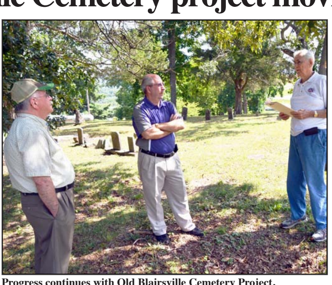
Progress continues with Old Blairsville Cemetery Project.

and approximately 50 unmarked graves, the cemetery is packed with history