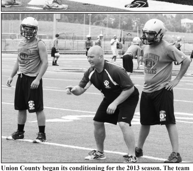
Union County began its conditioning for the 2013 season. The team will travel to Camp Jabez on Wednesday and return Friday. The first official practice will be on Aug. 5th. The Panthers will then host White County in a scrimmage on Aug. 22nd.